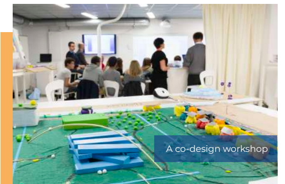
A co-design workshop

To be at the forefront of educational transformation, the Université Catholique de Lille imagines new ways of teaching and learning and sets up transdisciplinary modules and programs. Our students are able to experience these new methods thanks to spaces and projects dedicated to educational innovation . For example, our engineering students are trained to lead innovative and interdisciplinary projects in cooperation with businesses in real-life conditions . FabLabs and co-design spaces have been set up to foster collaborative exchanges, catalyze creativity and boost innovation .