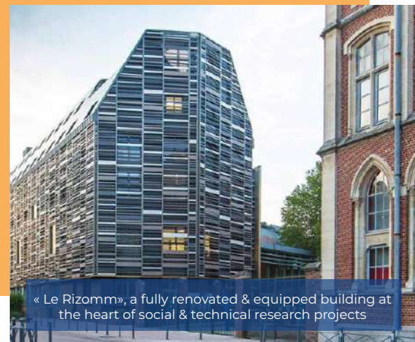
« Le Rizomm », a fully renovated & equipped building at the heart of social & technical research projects

Since 2013, we have been renovating our buildings to limit our carbon footprint and make them models of good practices , genuine laboratories; we are installing solar panels and use our own energy , we encourage sustainable and electric means of transport; we support research on connected farming and will develop a farm at the heart of the city.